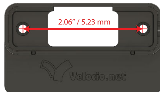
Image is to scale and can be used as drilling template